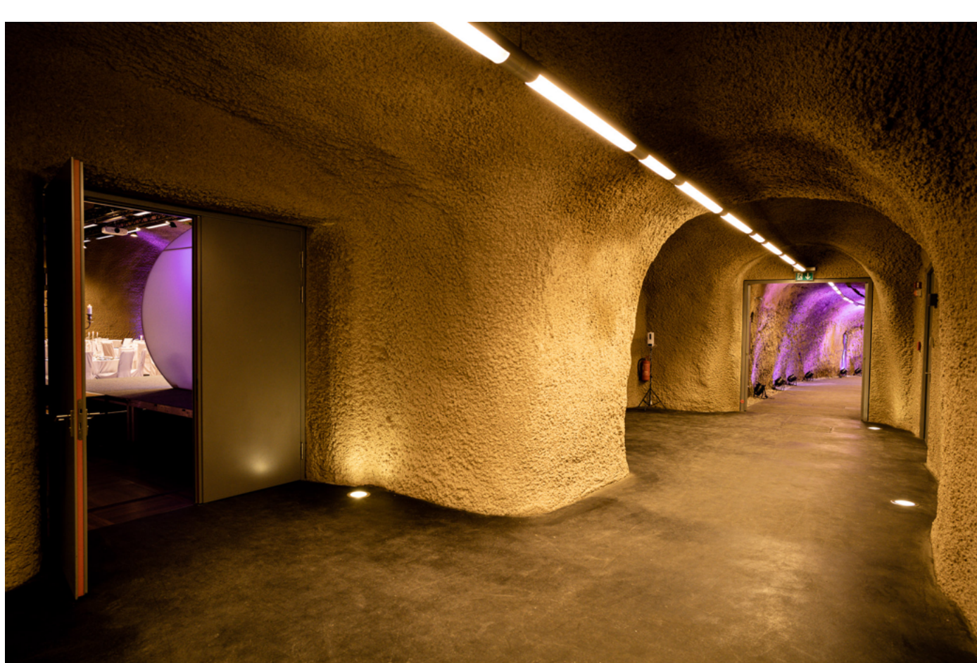
ELECTRO: »WOUNDS & WONDERS«

After two acclaimed electro evenings in the classical theatre atmosphere of the Felsenreitschule, the 2025 event will take place in a new, equally fascinating location - the kavernen 1595. These rooms in the centre of Salzburg, not far from the Mönchsberg lift, have existed since 1595 and have an archiepiscopal history.